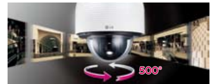
Max. 500°/sec HIGH SPEED PANNING & TILTING

The PTZ camera, it quickly and thoroughly monitors the preset areas through endless high-speed panning and tilting functions.